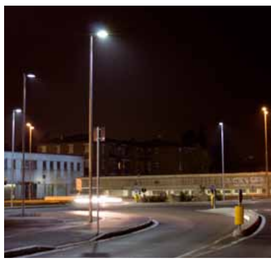
Con riserva di modifiche. Salvo errori e omissioni. / Subject to change. Errors and omissions excepted.